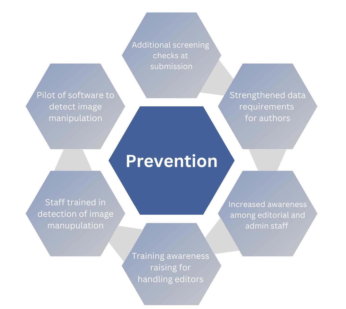
Figure 1. STM's flowchart to prevent academic fraud and reduce the burden on editorial staff, recreated from materials presented by the STM (48).

The International Association of Scientific, Technical, and Medical Publishers (STM) is spearheading the Integrity Hub, an effort to develop new tools to detect plagiarized and paper mills paper and further reduce some of the burden on editorial staff (48).